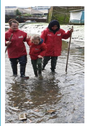
Year 5 children enjoying their learning in Deptford Creek