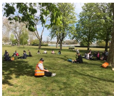
Packed Lunches in the Park

'I have so missed school trips,' one child said, and 'packed lunches outside with your friends.'