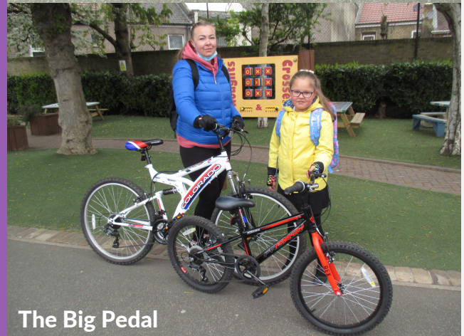
The Big Pedal