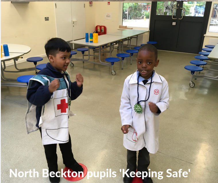
North Beckton pupils 'Keeping Safe'