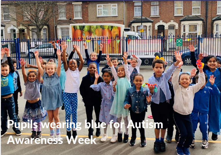
Pupils wearing blue for Autism Awareness Week

Pupils at Ranelagh marked Autism Awareness Week and showed their support by wearing all of the shades of blue and celebrating all that is fabulous about Autism.