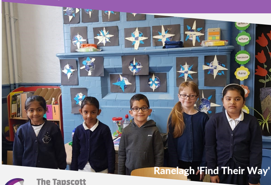
Ranelagh 'Find Their Way'

Year 2s at Ranelagh Primary School have been honing their positional skills by creating their very own compasses. This is all part of this term's geography field study skills