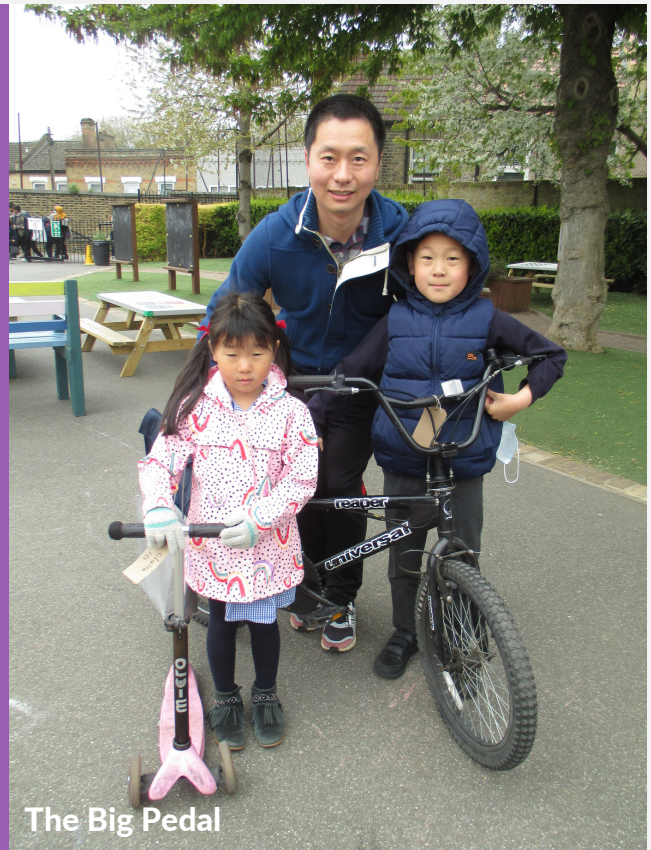
The Big Pedal

The children enjoyed participating in the Big Pedal Campaign. It has inspired pupils, staff and parents to take more active journeys to school and they will hopefully continue to do so.