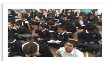
The audience spelling conceited

The audience were able to join in, sitting in anticipation of whether they chose the correct spelling rule.