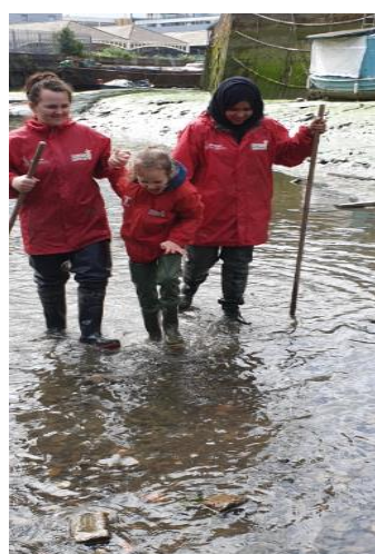
Year 5 children enjoying their learning in Deptford Creek